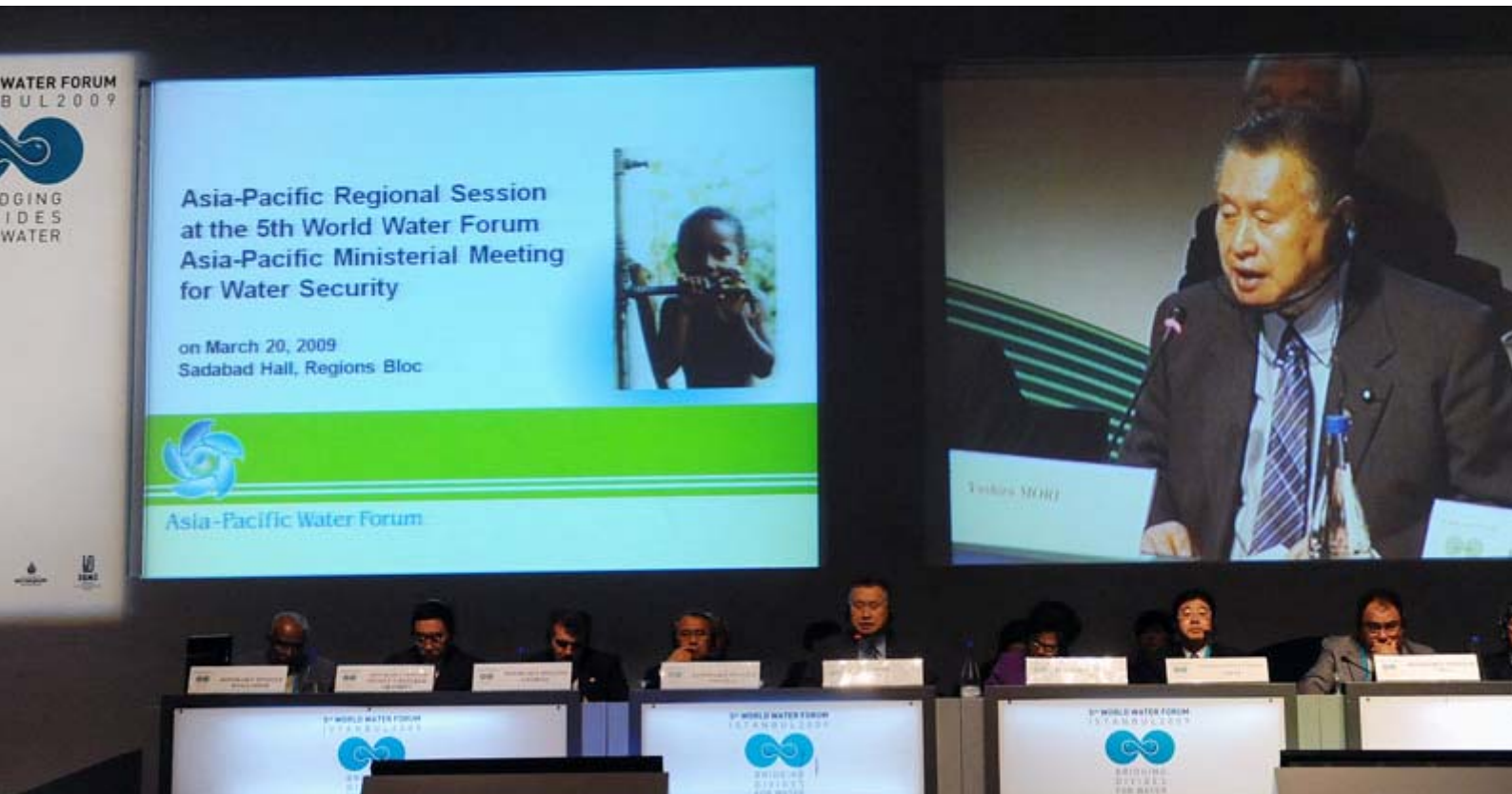
L-R: Ramesh Sen , Minister for Water Resources, Bangladesh; Chen Lei , Minister for Water Resources, People's Republic of China; Giorgi Khachidze , Minister of Environment and Natural Resources Protection, Georgia; Djoko Kirmanto , Minister of Public Works, Indonesia; Yoshiro Mori , President of the Asia-Pacific Water Forum (APWF); Erna Witoelar , Vice Chair of APWF Governing Council; Yasushi Kaneko , Senior Vice-Minister of Land, Infrastructure, Transport and Tourism, Japan; Faumuina Liuga , Minister for Natural Resources and Environment, Samoa; and Yaacob Ibrahim , Minister of the Environment and Water Resources, Singapore