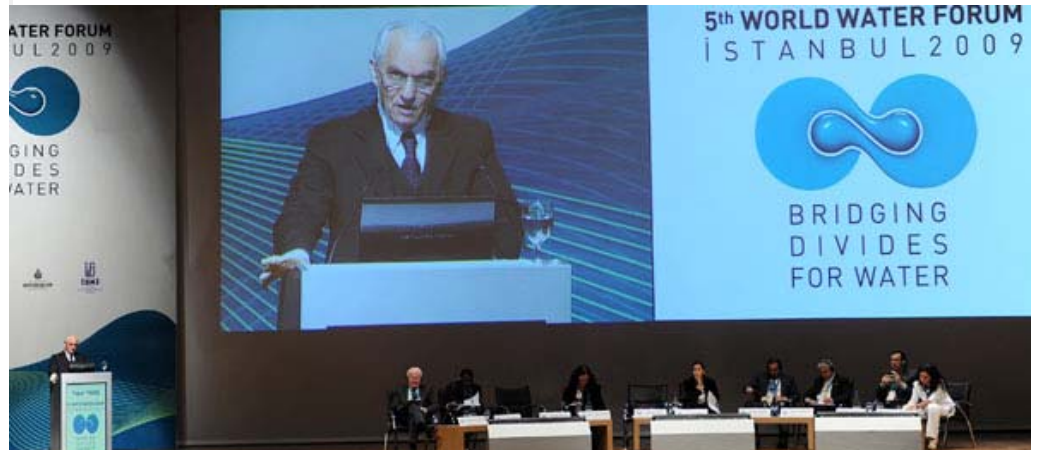
The dais during the session