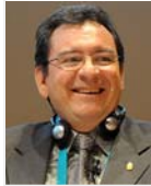
Oscar Castillo , Senator and Parliament of MERCOSUR, Argentina