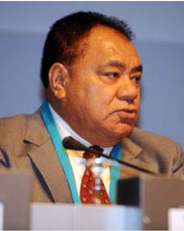
Faumuina Liuga , Minister for Natural Resources and Environment, Samoa