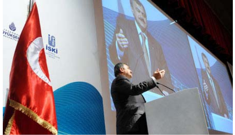
Veysel Eroğlu , Minister for Environment and Forestry, Turkey