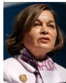
Sumru Noyan , Chair, Ministerial Process of the 5th World Water Forum