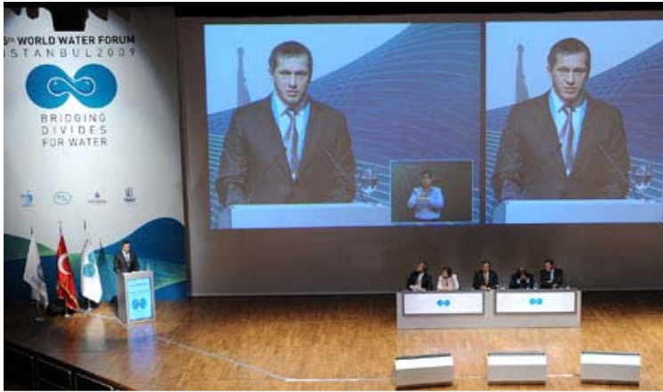
The dais during the session