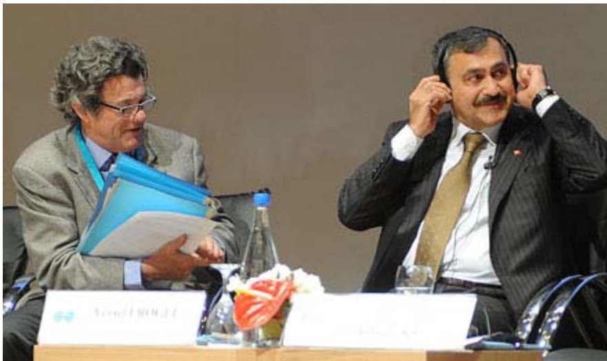
L-R: Jean-Louis Borloo , Minister of Ecology, Energy, Sustainable Development and Land Planning, France; Veysel Eroglu , Minister of Environment and Forestry, Turkey