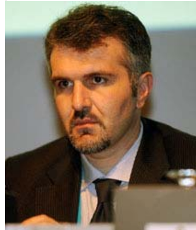
Giorgi Khachidze , Minister of Environment and Natural Resources Protection, Georgia