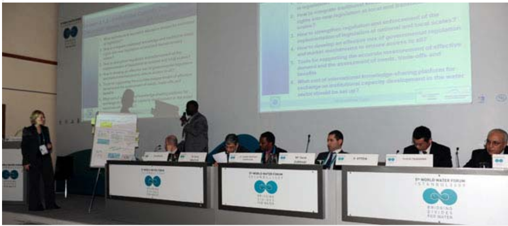
The outcomes of the working groups were presented at the end of the session on institutional capacity development