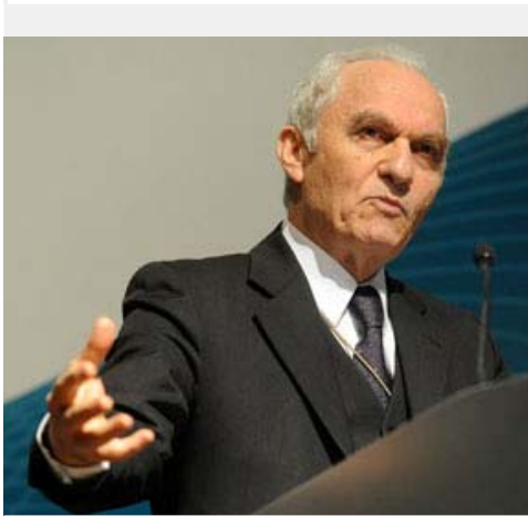
Yaşar Yakış , Former Minister of Foreign Affairs of Turkey