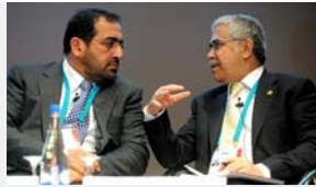
L-R: Rashad Ahmed , Minister of Environment and Water, United Arab Emirates, and Mustafa Öztürk , Parliamentarian, TGNA