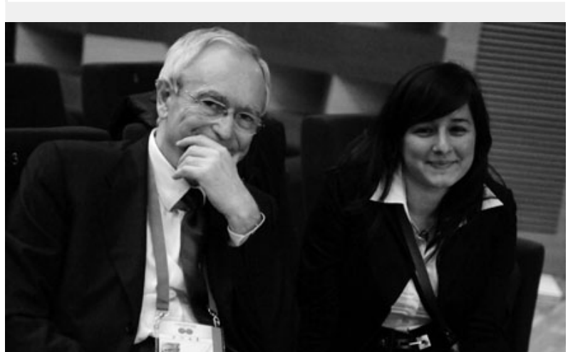
Oktay Tabasaran, Secretary General, World Water Forum, interacting with youth participants