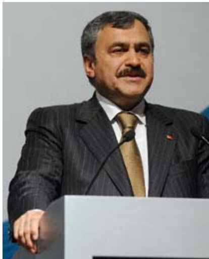
Veysel Erođlu , Minister for Environment and Forestry, Turkey