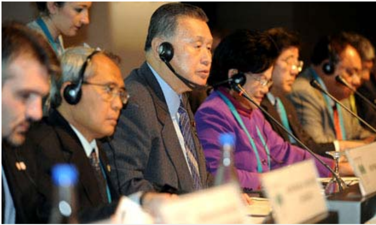
Yoshiro Mori , APWF President, opened the Asia-Pacific Regional Session, introducing the APWF's Ministers for Water Security Initiative as a platform for dialogue among ministers across sectors