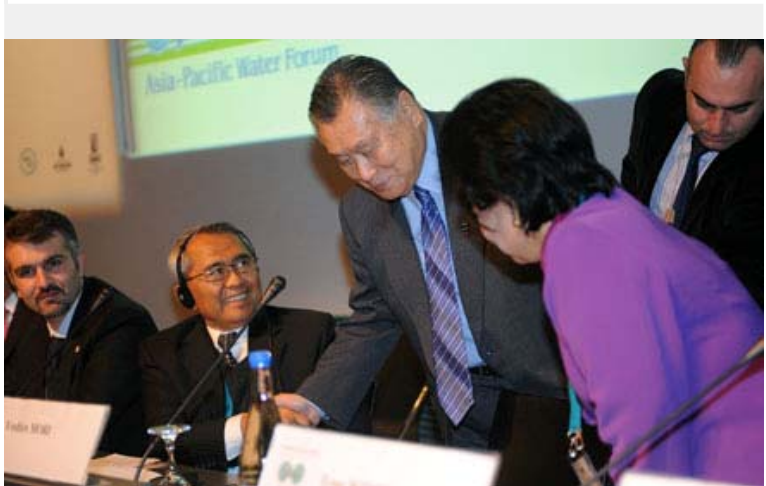
Yoshiro Mori , APWF President, prior to the start of the session