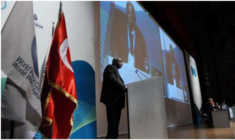
Jacques Diouf , Director General, FAO