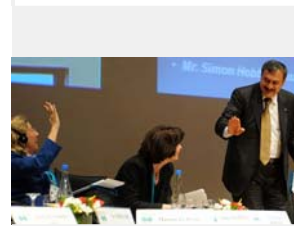
L-R: Julia Marton-Lefèvre , IUCN Director General; Tineke Huizinga , Vice Minister for Transport, Public Works and Water Management, the Netherlands; and Veysel Eroglu , Minister of Environment and Forestry, Turkey