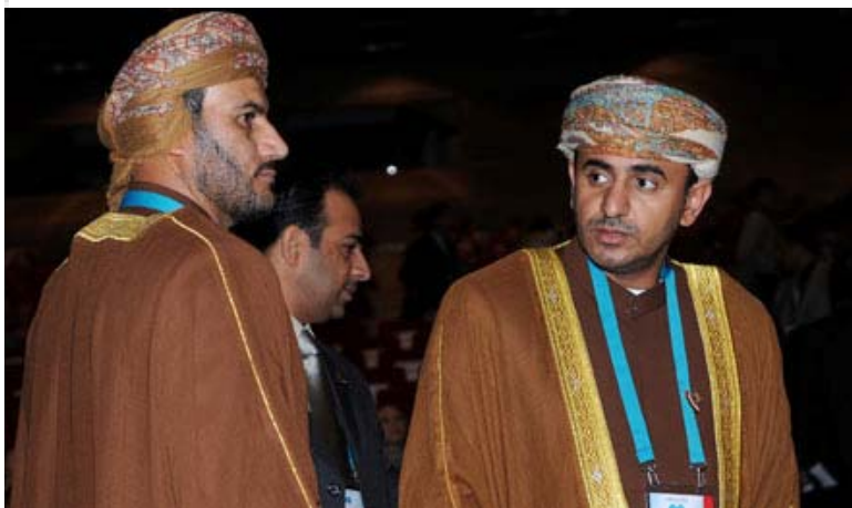
Delegates from Oman