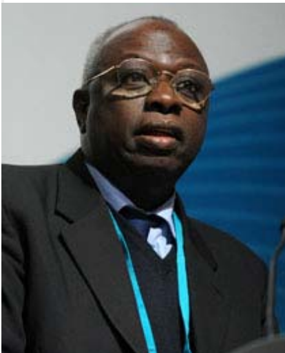
Jacques Diouf , Director General, FAO