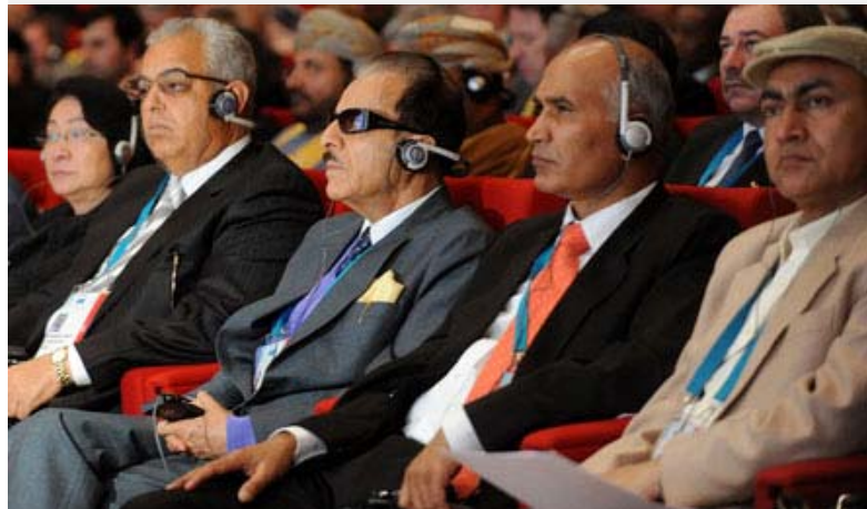
Participants during the session