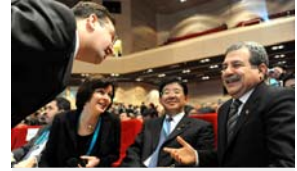
Delegates prior to the start of the session