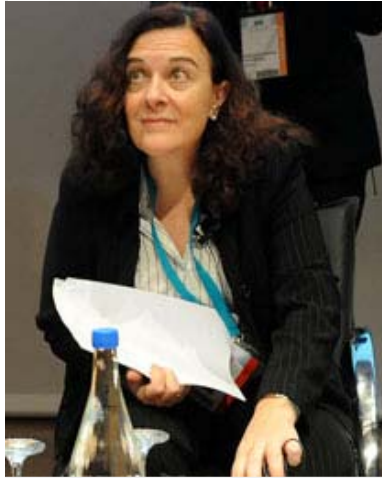
Ines Ayala Sender , Parliamentarian, European Parliament