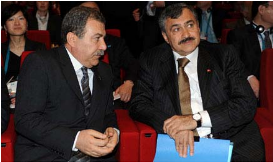
L-R: Muammer Güler , Governor of Istanbul, and Veysel Eroğlu , Minister for Environment and Forestry, Turkey